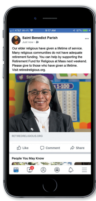
Social media post

(Arch)bishop to Parishioners letter Coordinator communications Poster Print and web advertisements Social media tool kit